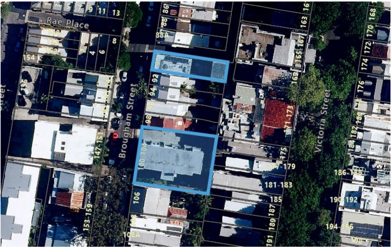
Figure 1. Aerial image showing the site's location

The site is located in Potts Point approximately two kilometres east of Central Sydney. Uses along Brougham Street are predominantly residential, and the most common building type is three storey terrace dwellings with dormer roofs. There is approval for a hotel use at 92-98 Brougham Street, which sits between these two properties.