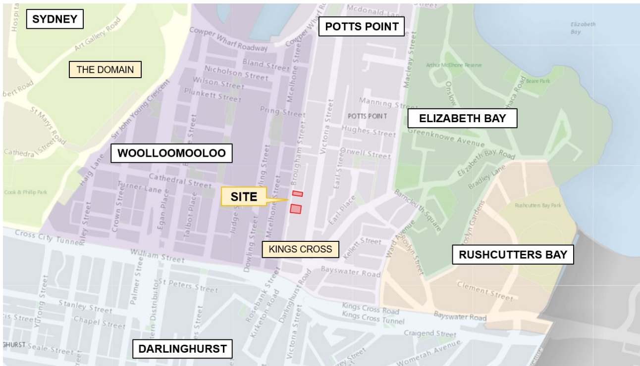
Figure 2. Indicative plan showing the site's context and suburb boundaries