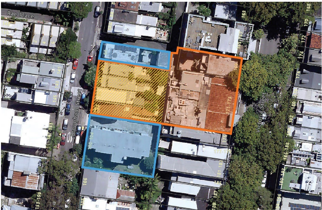
Figure 5. The Piccadilly Hotel